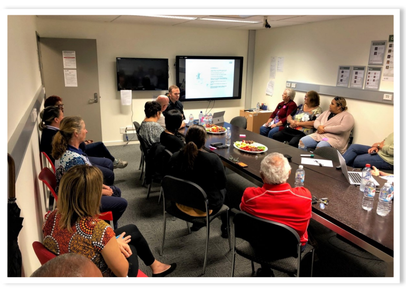
Valued representatives from the local Aboriginal community talk to the project team.

clinical leads and health service staff. Consumer Reference Groups will be established as the project progresses.