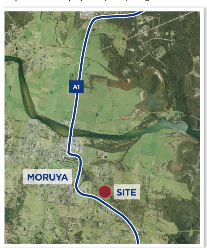
Figure 1. Site Selected

The Site Master Plan is in the process of being reviewed by key stakeholders and design workshops are scheduled to go ahead in May 2021 to commence Functional Briefing. Design workshops help to inform the Concept and Schematic Design and will include Project User Groups (PUGs) comprising nominated