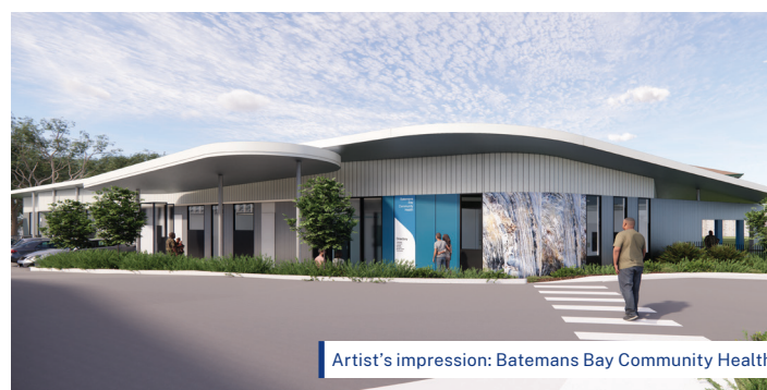
Artist's impression: Batemans Bay Community Health