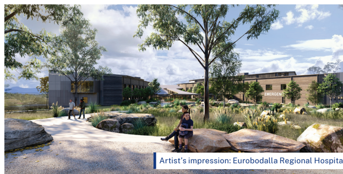
Artist's impression: Eurobodalla Regional Hospital

Batemans Bay Community Health email: HI-BatemansBayhealth@health.nsw.gov.au