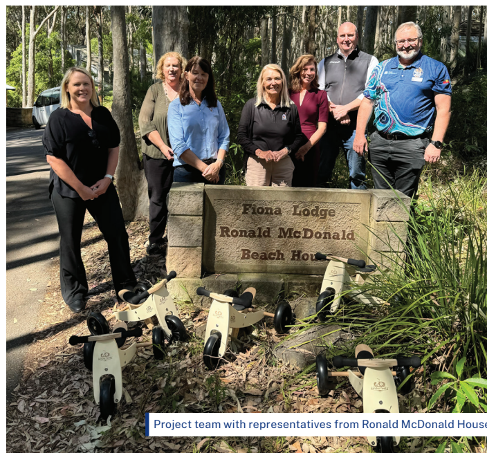
Project team with representatives from Ronald McDonald House